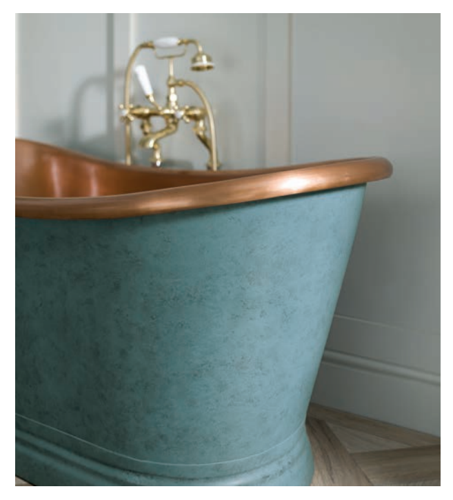
Lacquered antique copper interior with Verdigris effect exterior