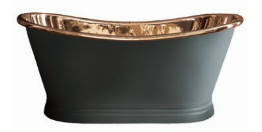
Unlacquered polished copper interior with F&B studio green painted exterior

Create a distinctive statement within your bathroom with this freestanding roll top Copper bath. Manufactured in a traditional hand crafted manner creating gentle undulations and colour variation that make each individual bath unique. The interior is available in either lacquered antique copper or unlacquered polished copper. The unlacquered polished copper is a living finish that will patina over time or can be polished and waxed to maintain a polished shiny finish. The exterior is available in a range of matt painted colours suitable for the bathroom environment. Alternatively a Verdigris effect finish is available to complement the copper interior.